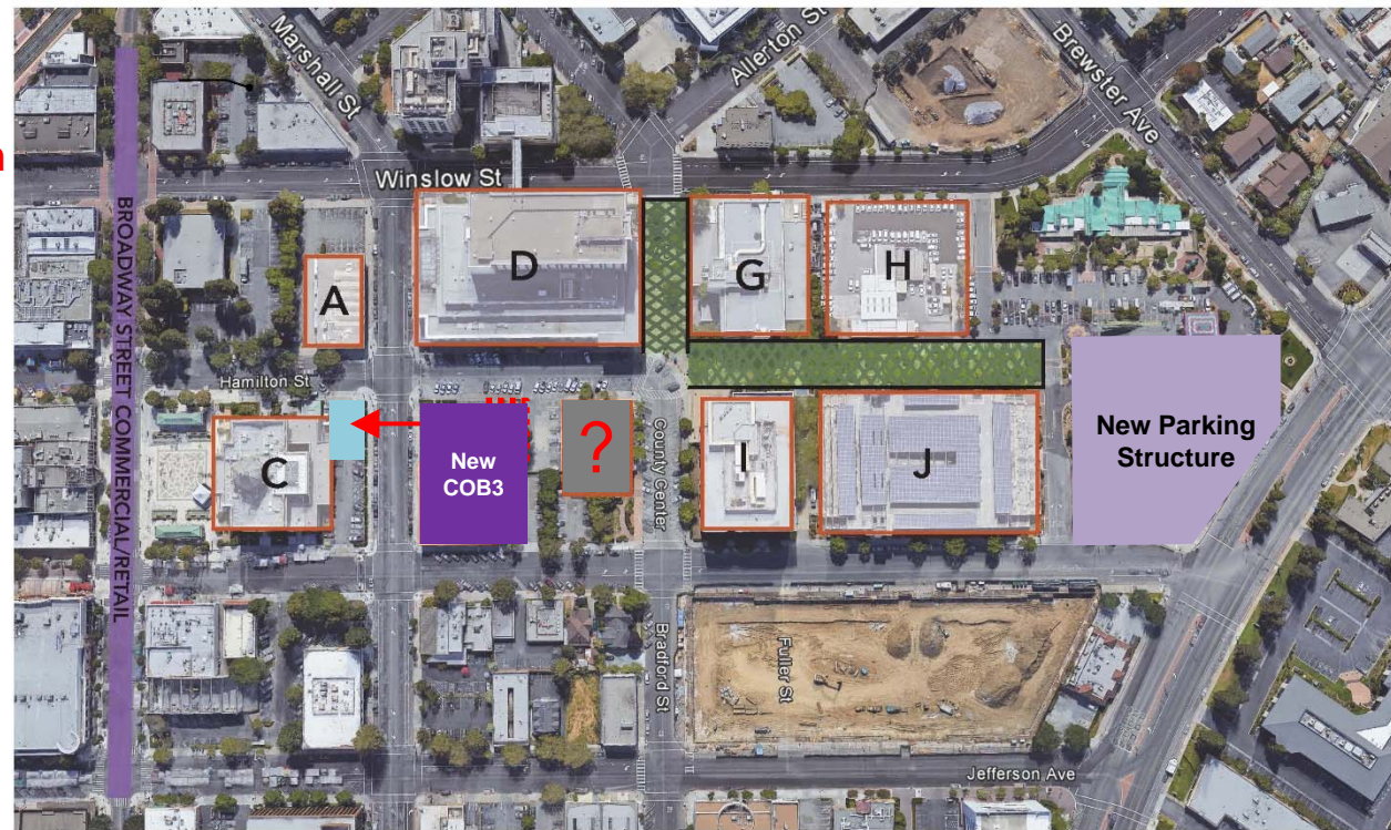
Site Plan – Existing Condition